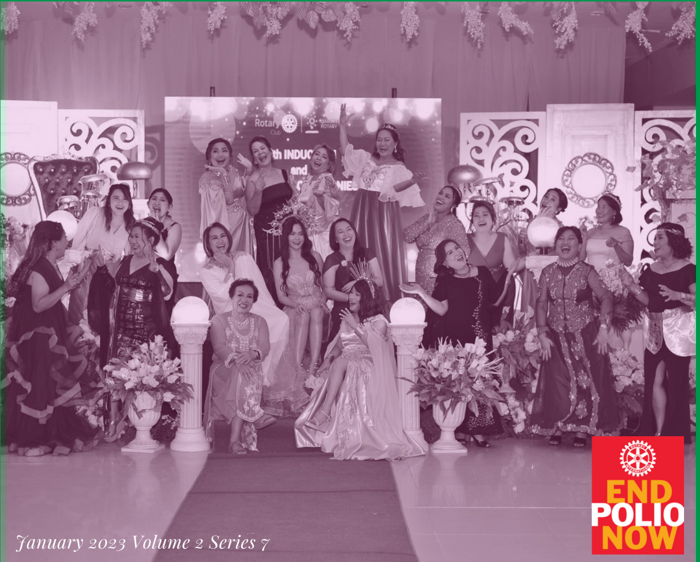
January 2023 Volume 2 Series 7